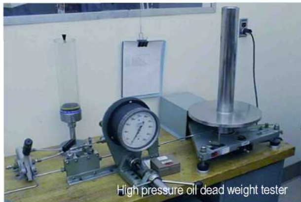
High pressure oil dead weight tester