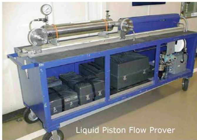
Liquid Piston Flow Prover

Experience includes rotameters, turbine meters, mass flow meters, and bubble meters