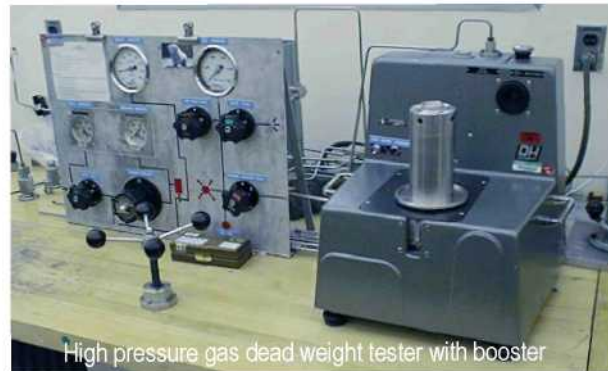
High pressure gas dead weight tester with booster

Experience includes gauges, transducers, transmitters, and manometers