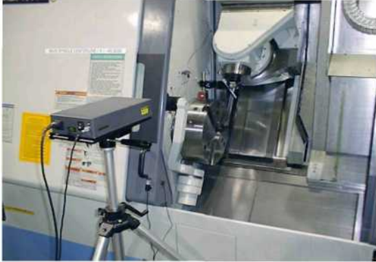
Laser interferometer testing machine tool travel accuracy