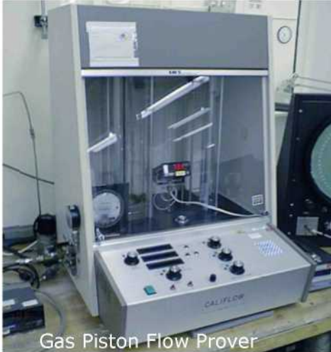
Gas Piston Flow Prover