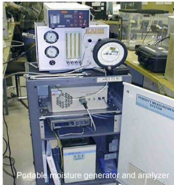
Portable moisture generator and analyzer

Experience includes chart recorders, dew pointers, trace moisture analyzers, etc.