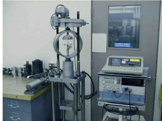
50,000lb tension/compression tester with proving ring

Experience includes transducers, force gages, load washers, and bolt stretchers