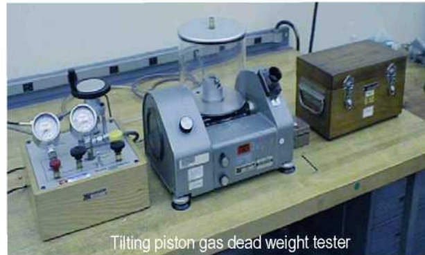
Tilting piston gas dead weight tester